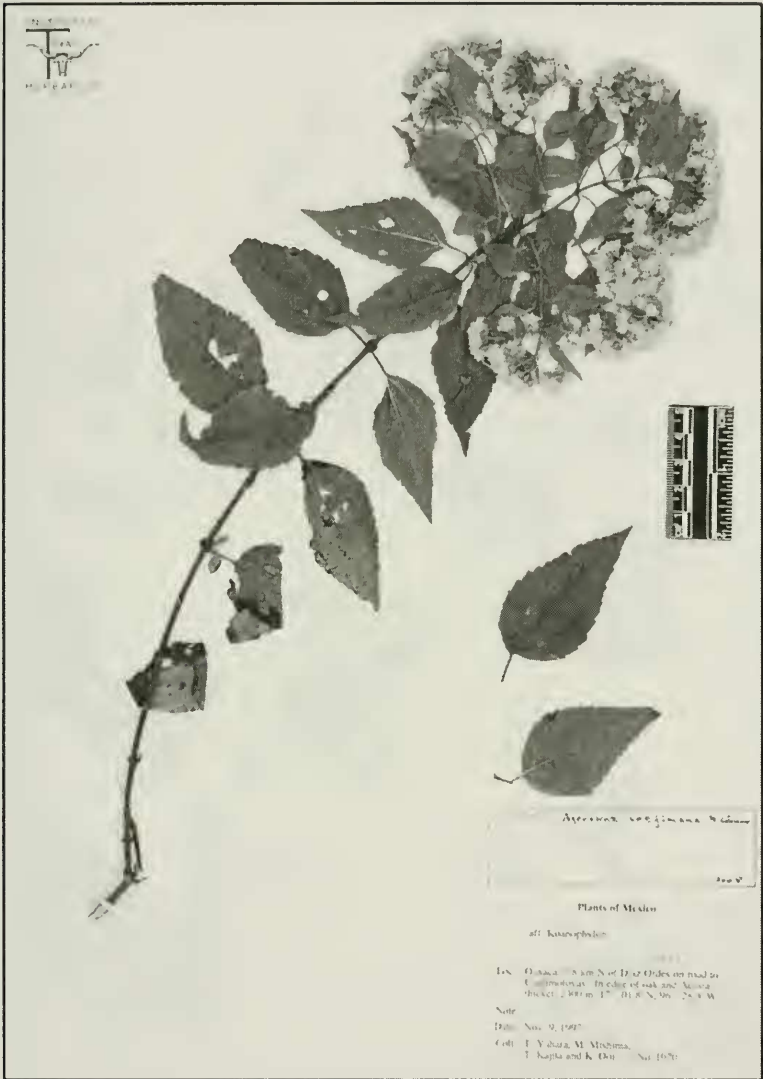
Fig. 3. Holotype of Ageratina soejimana .